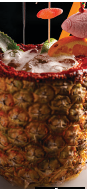
LA PIÑA LOCA

Tequila Reposado, Grand Marnier, Citrus Blend, Lime 12