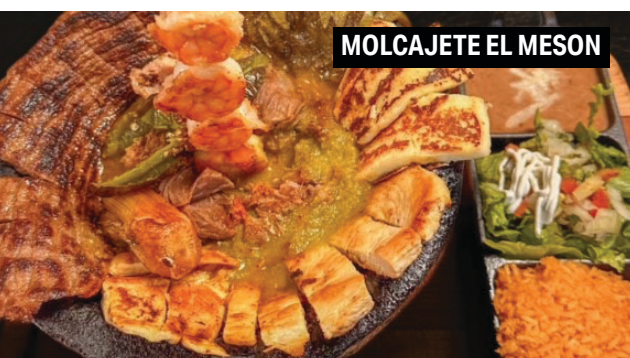
MOLCAJETE EL MESON

Two pork chops topped with sautéed onions, bell peppers and tomatoes. Side of rice and beans 16