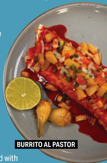
BURRITO AL PASTOR

Homemade carnitas and refried beans, smothered in cheese sauce, salsa verde and melted cheese. Served with a side of rice, fresh lettuce, sour cream, tomatoes and avocado dip 13.5