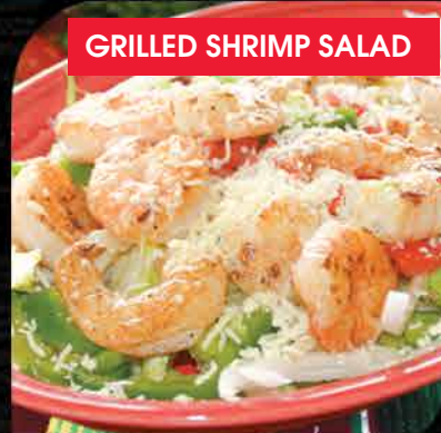
GRILLED SHRIMP SALAD

Please request if you like it with or without grilled vegetables