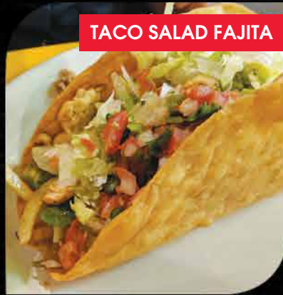
TACO SALAD FAJITA