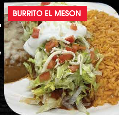
BURRITO EL MESON

A large flour tortilla filled with beef steak, covered with cheese sauce and served with rice and beans