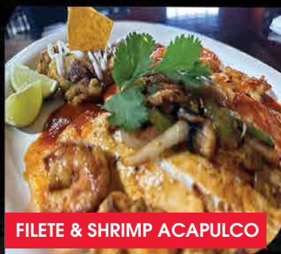
FILETE & SHRIMP ACAPULCO

Marinated grilled tilapia and shrimp with grilled onions, mushrooms, bell peppers and tomato. Tossed in Guajillo salsa with poblano mashed potatoes