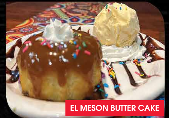
EL MESON BUTTER CAKE