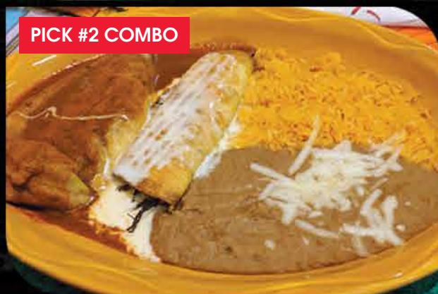
PICK #2 COMBO