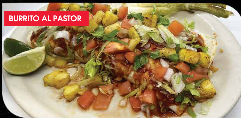
BURRITO AL PASTOR

Our large flour tortilla filled with refried beans, our homemade carnitas and smothered with green sauce and melted cheese, served with fresh lettuce, sour cream, pico de gallo, rice and Guacamole upon request