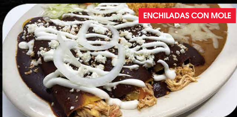
ENCHILADAS CON MOLE

Four enchiladas, one ground beef, one spicy chicken, one bean and one cheese topped with enchilada sauce, fresh lettuce, sour cream and tomatoes