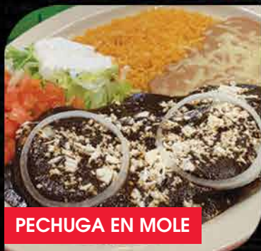
PECHUGA EN MOLE

Seasoned grilled chicken breast smothered with cheese sauce. Served with rice, beans, tortillas, fresh lettuce, tomatoes and sour cream