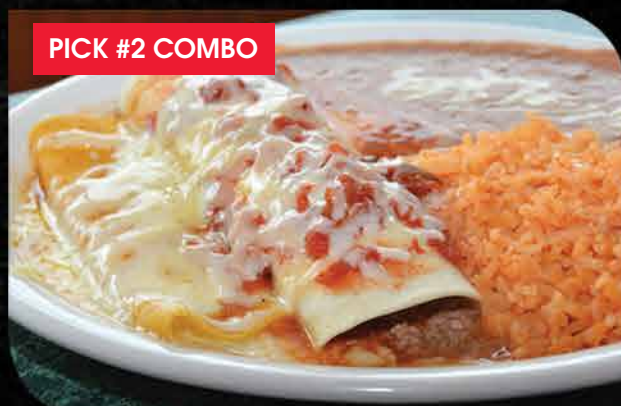
PICK #2 COMBO