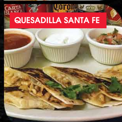
QUESADILLA SANTA FE