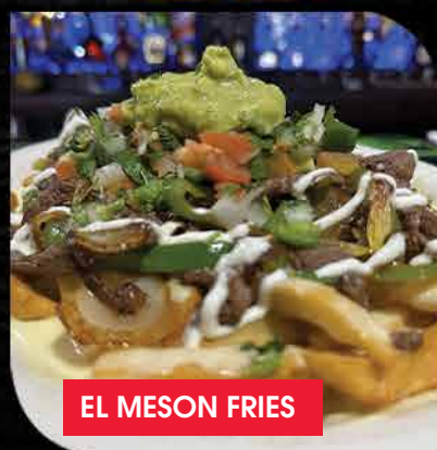
EL MESON FRIES